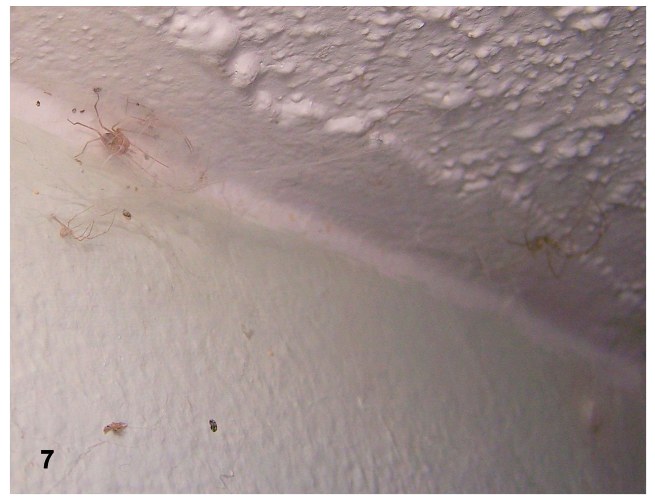
Figure 7. Adult male Cithaeron praedonius in nest in living room, recently molted, molt discarded outside nest. Note C. praedonius eggsac on wall at lower right. Also in background is another spider in a web, probably a Physocyclus globosus .

affecting the pet trade feeder cricket industry. Another possible source is the purchase by JTS of tarantulas at local "Repticon" events, a pet trade exposition, in the Tampa area. Potentially, tarantula specimens were imported and then sold at these events. If so, then it is possible that a gravid female or an eggsac of C. praedonius was on or in the shipping container.