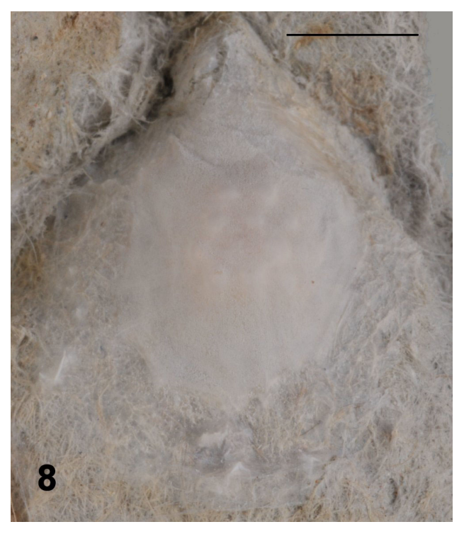
Figure 8. Eggsac of Cithaeron praedonius on egg carton. Scale line = 5 mm.

Other spiders, common in the room where most of the C. praedonius were found, were the amphinectid Metaltella simoni (Keyserling), the pholcid Physocyclus globosus (Taczanowski), and the theridiid Nesticodes rufipes (Lucas). An adult male corinnid, Trachelas volutus Gertsch, was also found in the same room. Another common synanthropic theridiid, Latrodectus geometricus C. L. Koch, was found in the garage and on the outside of the house; P. globosus was also found in the garage, and most likely the other two synanthropic species were there as well. A female C. praedonius in captivity killed and ate a N. rufipes female that exceeded its own body mass (Fig. 2, 3). All of the specimens captured 9 March readily caught and ate L. geometricus spiderlings.